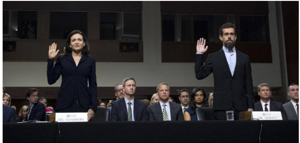
Facebook COO Sheryl Sandberg, left, accompanied by Twitter CEO Jack Dorsey are sworn in Wednesday before the Senate Intelligence Committee hearing on "Foreign Influence Operations and Their Use of Social Media Platforms."