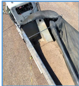
A truck driver fell 9 ½ feet while adjusting the tarp. He had climbed up the side of the truck into the bed and fell while walking on loose sand.

Between January 2019 and August 2020, MSHA issued 72 imminent danger orders for people working atop trucks, front end loaders, aerial lifts, bulldozers and railcars. The most common violations were equipment operators climbing atop their vehicles.