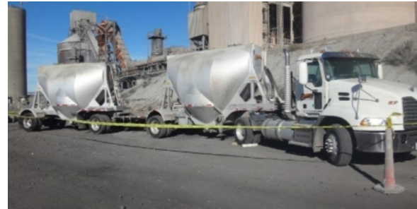
A miner fell approximately 12 feet from the top of the bulk trailer through a gap caused by misalignment of the tractor-trailer with the truck rack cage.